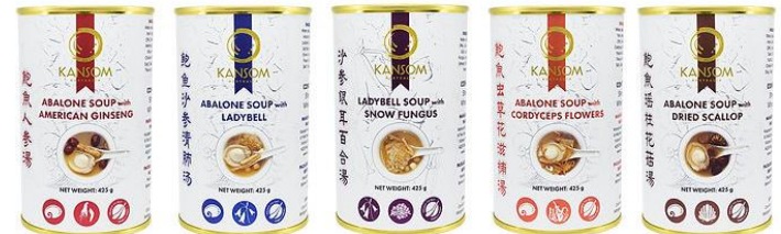
Abalone Soup with American Ginseng Abalone Soup with Ladybell Ladybell Soup with Snow Fungus Abalone Soup with Cordyceps Flowers Abalone Soup with Dried Scallop