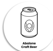
Abalone Craft Beer