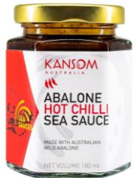
Abalone Hot Chilli Sea Sauce in 180ML Glass Jar

Our Abalone Hot Chilli Sea Sauce is perfectly balanced together. The perfect sauce for all those who enjoy the mouth watering and blazing taste of hot chilli.