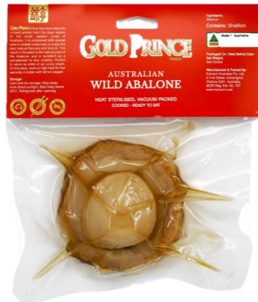
Natural Wild Blacklip Abalone in Retorted Pouch