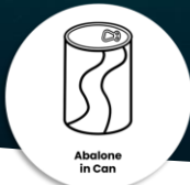
Abalone in Can