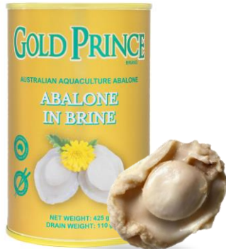
Abalone in Whole

Australian Aquaculture Abalone is of the highest standard and operates under strict environmental controls and guidelines by the Australian Government. Our Aquaculture Abalone is tender with a subtle taste.