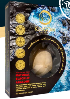
Natural Wild Blacklip Abalone in Retorted Pouch