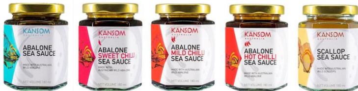
Abalone Sea Sauce Abalone Sweet Chilli Sea Sauce Abalone Mild Chilli Sea Sauce Abalone Hot Chilli Sea Sauce Scallop Sea Sauce