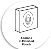
Abalone in Retorted Pouch