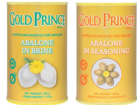
Aquaculture Blacklip Abalone In Can