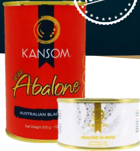
Natural Wild Blacklip Abalone in Brine