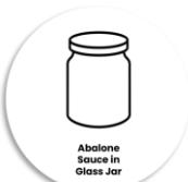
Abalone Sauce in Glass Jar