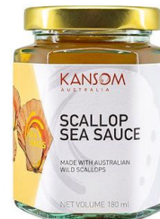
Scallop Sea Sauce in 180ML Glass Jar

Our Scallop Sea Sauce is a bold Sea Sauce that brings out the flavour of scallop, giving seafood dishes a fresher taste. Like all our Sea Sauces it reduces the need to use salt and is a perfect and natural enhancement to any meal.