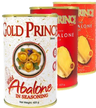
Natural Wild Blacklip Abalone In Can