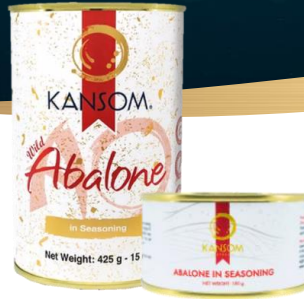
Natural Wild Blacklip Abalone in Superior Sauce