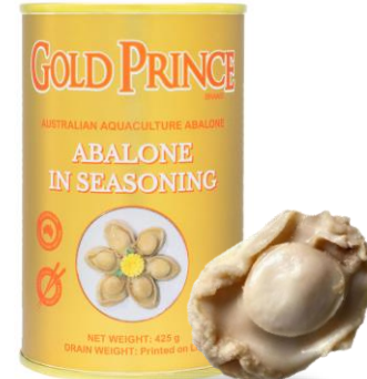
Abalone in Whole

AVAILABLE IN: 1P/85G Drain Weight 1-2P/140G Drain Weight 2-3P/170G Drain Weight