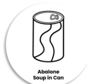
Abalone Soup in Can